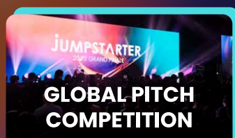
GLOBAL PITCH COMPETITION

JUMPSTARTER 2026 will spotlight AI and sustainability. Immerse yourself in world-class speakers, innovative startups, and invaluable networking opportunities. Lead the pack in AI trends and sustainability impact , drive business evolution, and harness the power of connections and inspiration. Secure your spot now!