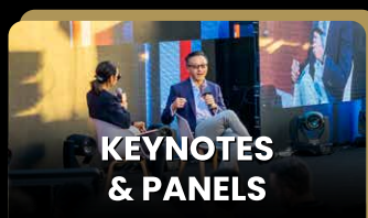
KEYNOTES & PANELS