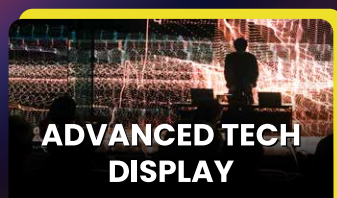
ADVANCED TECH DISPLAY