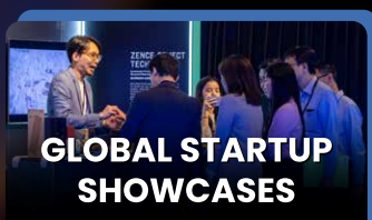
GLOBAL STARTUP SHOWCASES