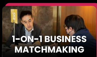
1-ON-1 BUSINESS MATCHMAKING